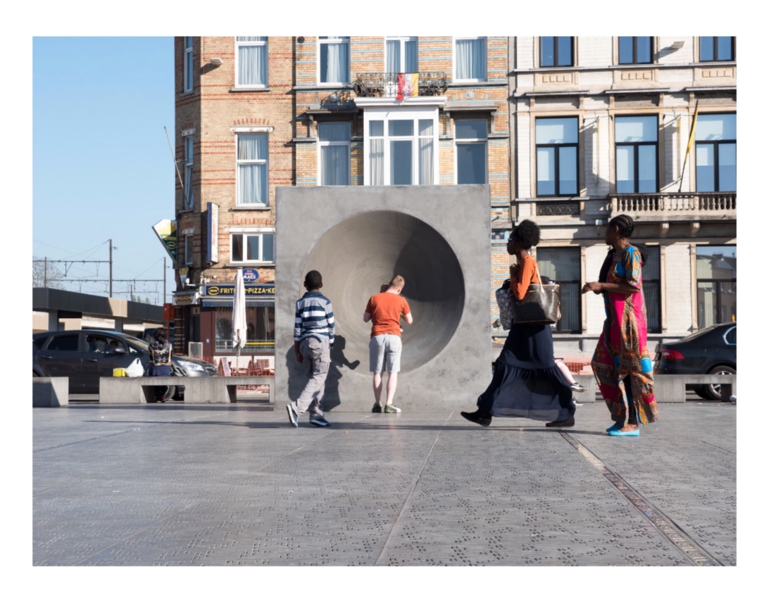
Tim Bruniges | MIRRORS Aalst (2017) | concrete, microphones, speakers | infinite duration | installation view City of Aalst, Belgium