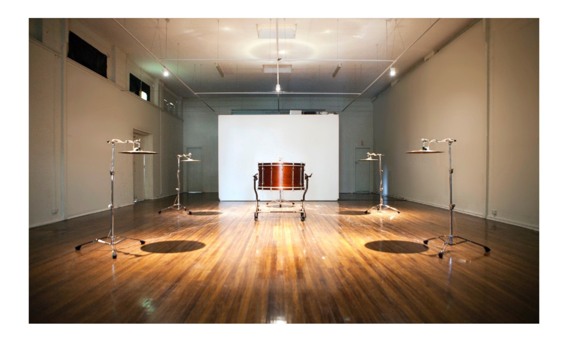
Tim Bruniges | DRUM ROOM (2013) | bass drum, cymbals, 5.1 sound | infinite duration | installation view Kudos Sydney