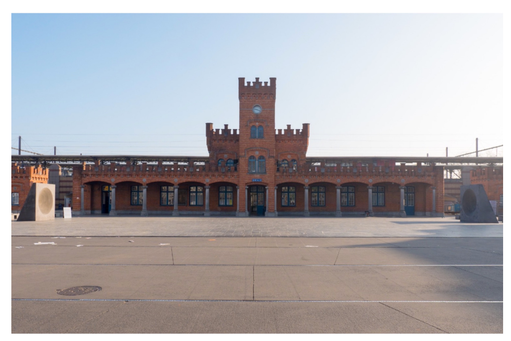
Tim Bruniges | MIRRORS Aalst (2017) | concrete, microphones, speakers | infinite duration | installation view City of Aalst, Belgium